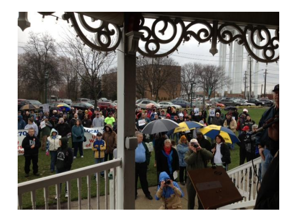
The rally was attended by many different Union organizations but only one other Teachers Association, the SHTA!